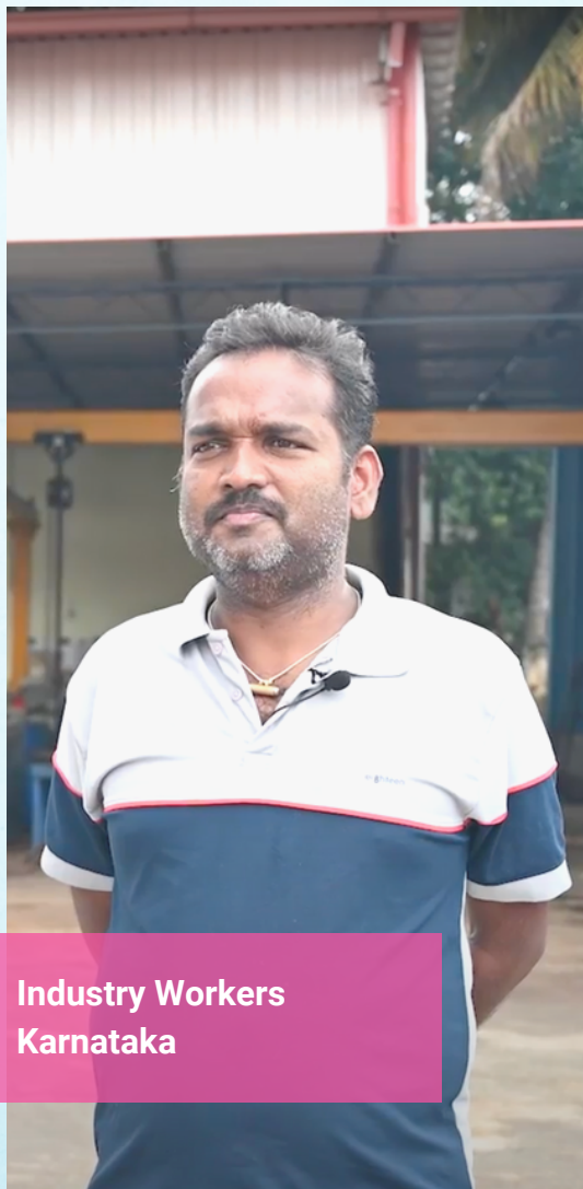
Industry Workers Karnataka